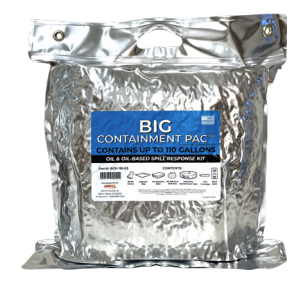
Oil & Oil-Based