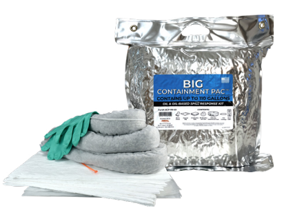
It's a spill kit and a containment pool all in one!